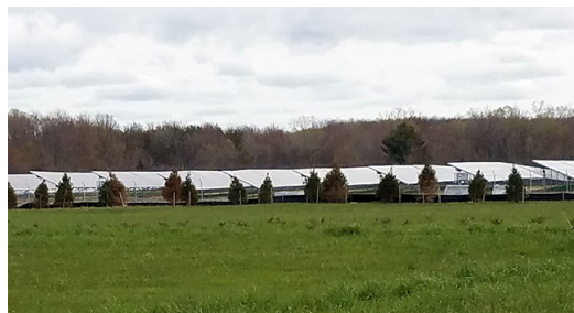
SG Ontario Sun PV