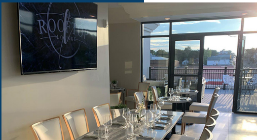
The Rooftop at Litro