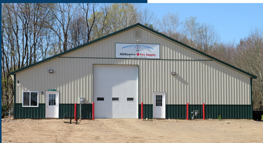
AllSource Fire Supply